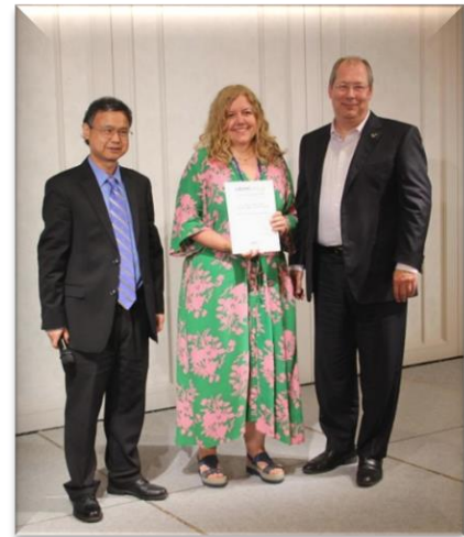
Award Ceremony, GDN Conference, Tokyo, 2023.