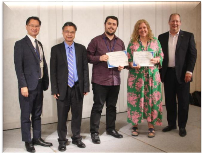
Award Ceremony, GDN Conference, Tokyo, 2023.