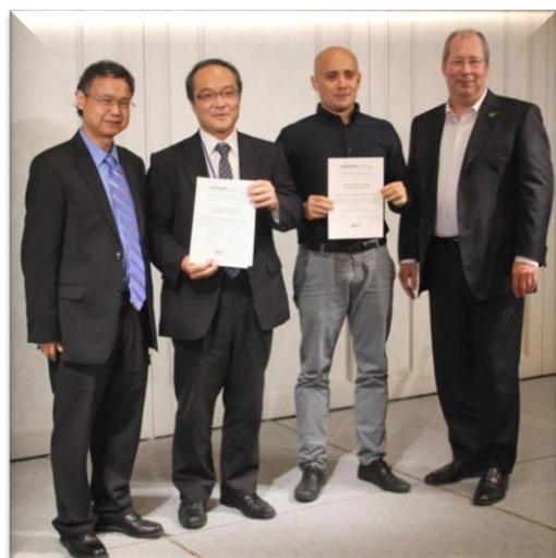
Award Ceremony, GDN Conference, Tokyo, 2023.