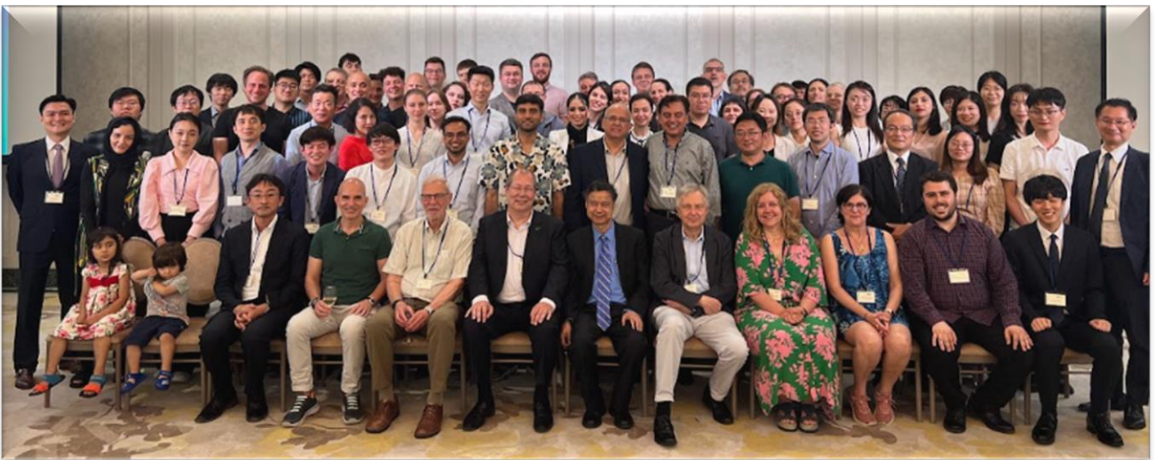
GDN community members. GDN 2023 Conference Dinner, Tokyo, 2023.

GDN 2023 was sponsored by the Group Decision and Negotiation (GDN) Section, Institute for Operations Research and the Management Sciences (INFORMS). This year the conference received a total of 103 submissions from 20 countries in Europe, the Americas, and Asia. 90 submissions were accepted to be included and presented at GDN 2023. After a rigorous blind review process, the GDN 2023 conference proceedings are organized and published in two volumes. 11 full papers were chosen for inclusion in a volume published by Springer ( https://link.springer.com/book/10.1007/978-3-031-33780-2 ). The second volume is composed of 79 full and short papers as well as abstracts, also selected in a thorough blind review process. Information about the second volume is available on the conference website ( https://gdnconference.org/gdn2023/local-proceedings/ ).