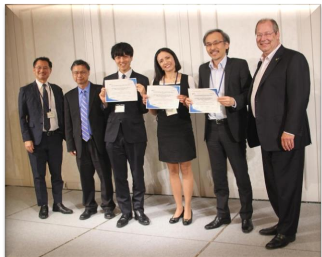
Award Ceremony, GDN Conference, Tokyo, 2023.